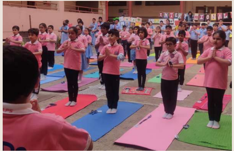
Learning The Art Of Living With Surya Namaskaar

Students of Cambridge 3-10 celebrated International Day of Yoga, performing Surya Namaskar and meditation to relax their bodies and calm their minds. Empowered minds, Energized souls!!