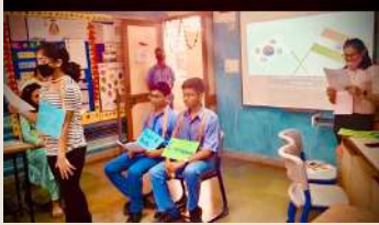
Spruce Up Action