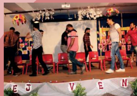
Parents-It's Time To Play !