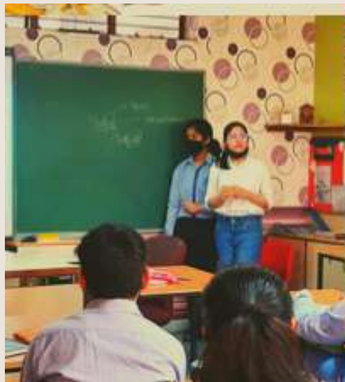
Mindfull vs Mindful : The State Of Mind