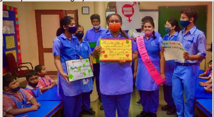
#Heforshe, Gender Equality

It is important to wash your hands regularly, especially in case of outbreaks of infectious diseases. The students of CAM 1 and 2 initiated a campaign called "Germ Busters" to raise awareness about the importance of washing hands. It also emphasized on the correct way and sequential order of washing hands. Let us all remember to wash our hands regularly and thoroughly!