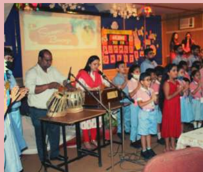
Seeking Blessings From Goddess Saraswati

Budding entrepreneurs of CAM 1-10 organised 'SUMMER BONANZA' - a meet and greet session with parents, teachers and students. Food stalls , fun games and interactive sessions were enjoyed and cherished by all .