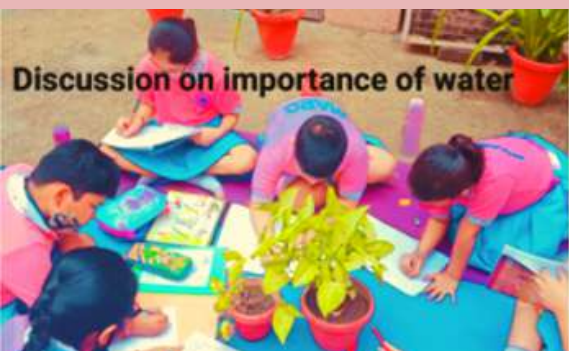
Learning By Doing Helps Engage Learners And Enhance Their Cognitive Skills!