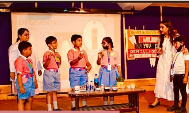
Let's Go Live