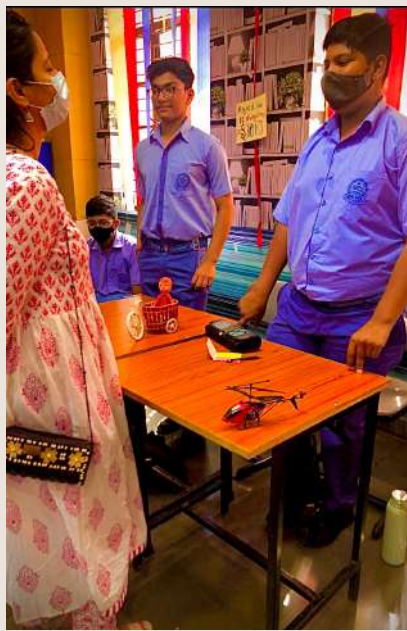
Fun Activities With Parents