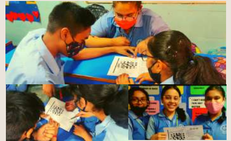
शब्दों के रंग , वर्ग पहेली के संग

Having a teacher that challenges you with different tasks, projects and games makes learning an unconventional experience. At Cambridge, we do exactly the same !