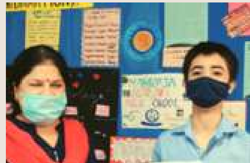
Cultivating A Culture Of Gratitude