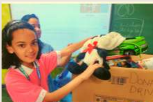
The Act Of Kindness