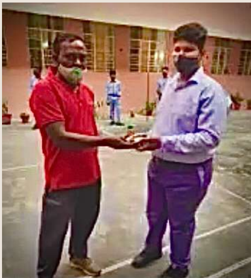
Be The Change You Wish To See.