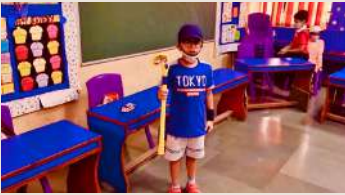
Characters Brought To Life