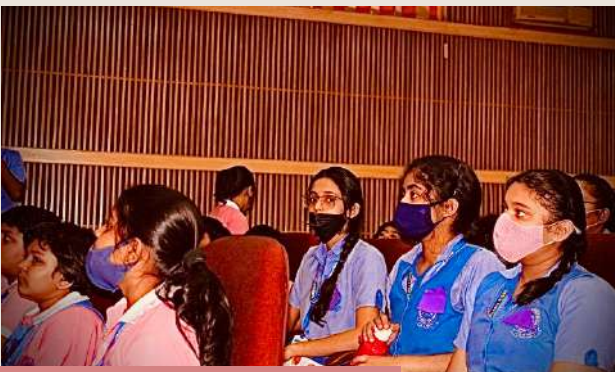
It's All About Perspective

"You don't have to brush all your teeth, just the ones you want to keep"