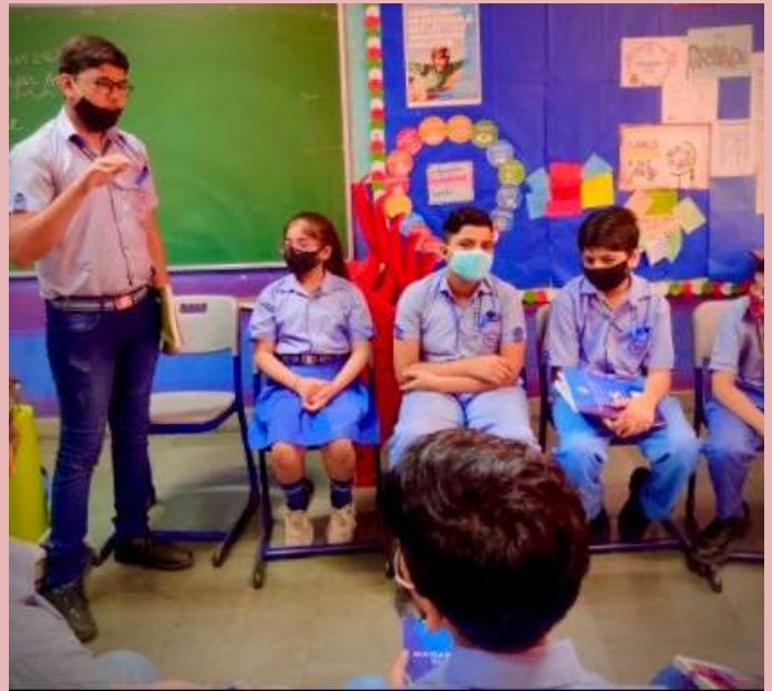
The Battle Of Wits

“We’re changing the world with technology” The digitalized era has made our lives easier. National Technology Day is widely observed on 11th May to mark the radical rise of technological advancements in India post independence. Students of Cambridge wing dressed up as exclusive gadgets and defined how they're useful in our day-to-day lives. A fiery debate stirring the minds of many left the audience pulsating with excitement.