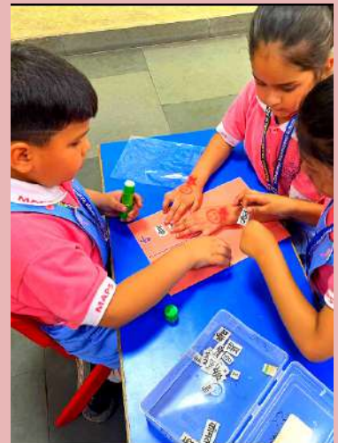
इ और ई की मात्रा