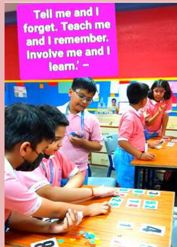
Making Decimal Numbers And Learning Place Value Using Number Cards And Abacus!