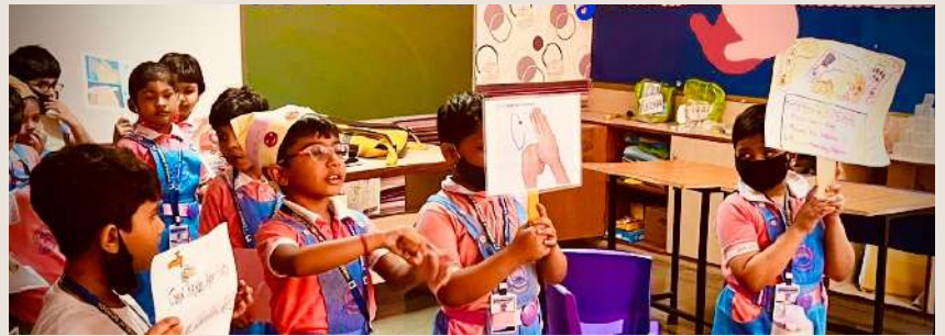
Campaign For Adopting Hygienic Lifestyle

7 steps of hand-washing. Are you doing it right ?