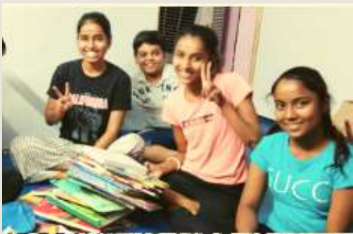
Smiling Faces Enjoying The Meet And Greet