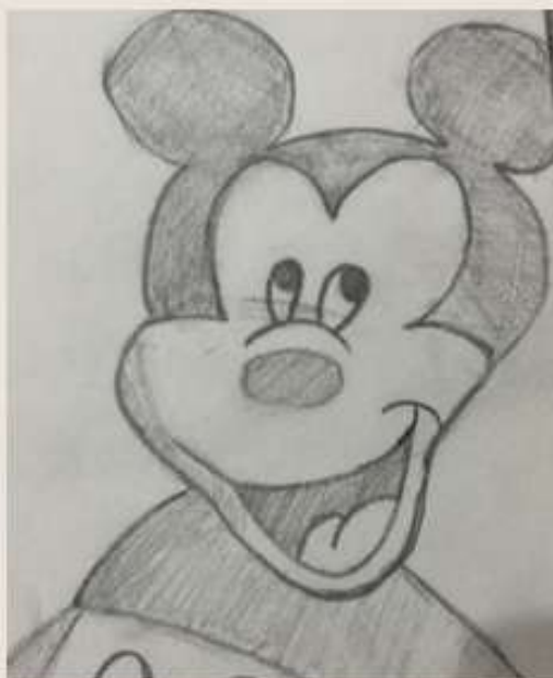
MRIGHVIJAY ARORA Cambridge 9