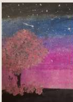
HITAISHI YADAV Cambridge 5