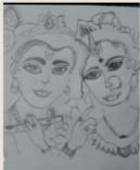
AISHWARYA GOEL Cambridge 9