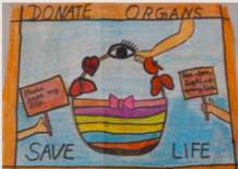
NAVYA GUJRAL Cambridge 3