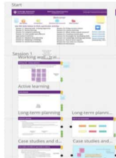
Collaboratively working on Miro board