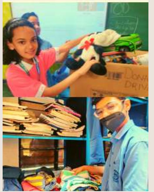
The Act Of Kindness