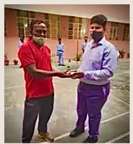
Be The Change You Wish To See.