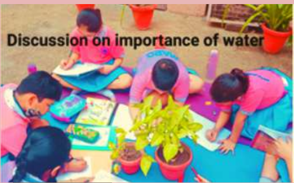
Learning By Doing Helps Engage Learners And Enhance Their Cognitive Skills!