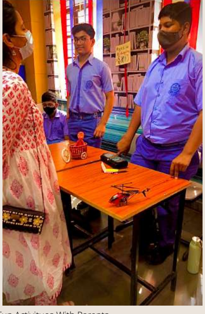
Fun Activitues With Parents