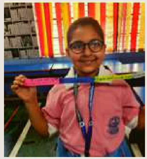
Designing Respect Chain For Enhanced Relationship