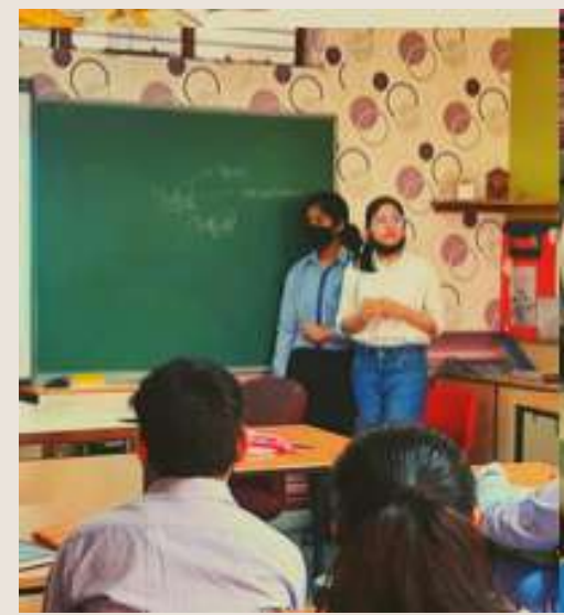
Mindfull vs Mindful : The State Of Mind