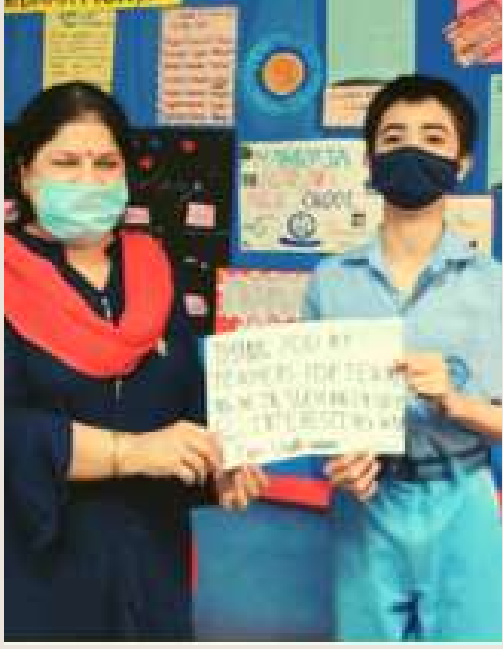
Cultivating A Culture Of Gratitude