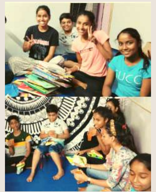
Smiling Faces Enjoying The Meet And Greet