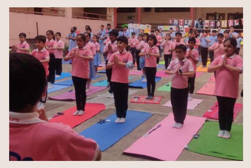
Learning The Art Of Living With Surya Namaskaar

Students of Cambridge 3-10 celebrated International Day of Yoga, performing Surya Namaskar and meditation to relax their bodies and calm their minds. Empowered minds, Energized souls!!