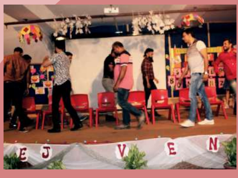
Parents-It's Time To Play !